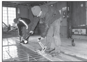
Installation of radiant panels - solar powered

Next, we are installing our heat recovery ventilation system with similar attention to flexible usage patterns and energy efficiency. All appliances will likewise be selected with a premium placed on energy efficiency and durability. Attention to these details achieves PRLC's goals 1. preserving the historic character and landscape viewshed of the residence so important to our community, 2. mitigating the residence's environmental footprint and, 3. demonstrating how to 'live lighter on the land' while providing a residential living space ahead of modern standards and with reduced life-cycle costs. The Armstrong Land Steward's Residence and Educational Center has been designed and built as a future, net-zero energy structure.