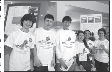
FLHS Students at Bedford 2020 Sustainability Event

Your home-grown land conservancy... yes- we're your neighbors and friends...have enjoyed our many outreach and education events these past few months. Not only are we one of the largest land-owners in Pound Ridge with 350 acres in 15 protected preserves, we also participate in community events showcasing land and natural resource conservation and environmental sustainability. These juniors at Fox Lane High School stopped by our booth at the Bedford 2020 Sustainability event in January to learn about community service opportunities with us, whether on the trail, building out our edible community garden at the Armstrong Preserve, or doing research on habitat protection. Just this past month, we participated in the John Jay High School Sustainability event, showcasing the philosophy of 'living lighter on the land' with our off-the grid Armstrong land steward residence and soon to be open, education and resource center. Our educational exhibit at Scotts Corners' Market in early May was the first of many community outreach efforts highlighting what private landowners can do to protect important habitat in town, and conserve their land in perpetuity by conservation easement which restrict future development. These private efforts, over the 35 years of PRLC existence, have created our 15 protected preserves, trails throughout town, and wooded and wetland viewsheds, which we all cherish as part of our town's living legacy.