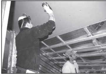
Installation of sustainable drywall

Prior bead-board wall and ceiling coverings have been reconditioned and reapplied minimizing introduction of new materials and maintaining the historic feel of structure. Where bead-board is not used as a wall covering, a greener, more sustainable drywall has been substituted. Our drywall is manufactured with post and pre-consumer recycled content and faced with 100% recycled post consumer paper. Drywall sheets have been locally sourced having been manufactured at a plant within 500 miles from the project site. This GreenGuard indoor, air quality certified, wallboard with its impregnated mold resistance, mitigates issues relating to durability and indoor air quality of standard drywall.